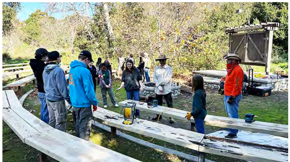
Restoration job in progress - 2024