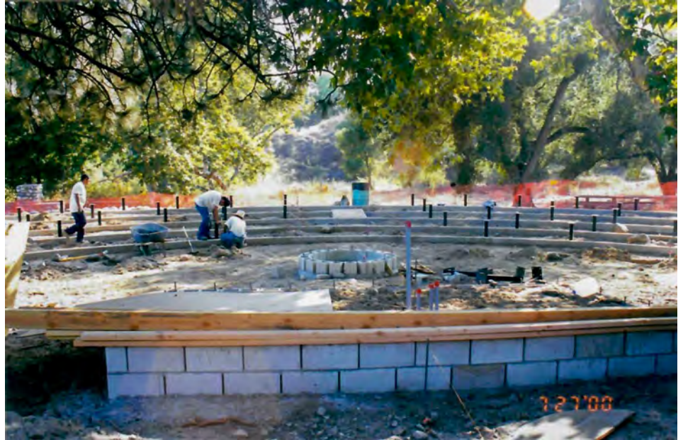
Original construction of outdoor classroom - 2000