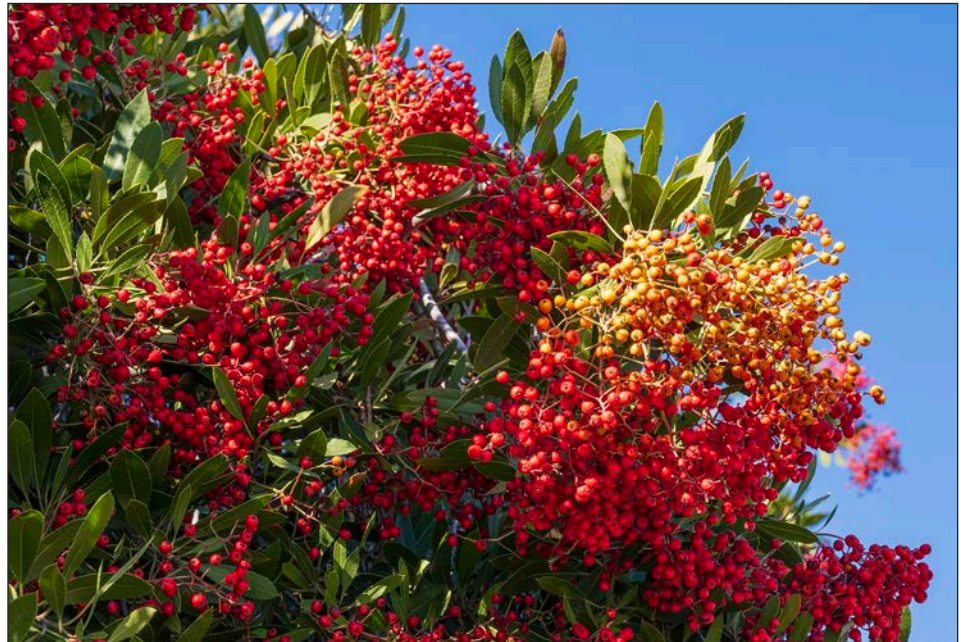
Toyon - Heteromeles arbutifolia

One of the books used for our ECNCA Docent Training class is, "Secrets of the Oak Woodlands" by Kate Marianchild. As the holidays approach I thought I'd share an excerpt from the Toyon chapter.