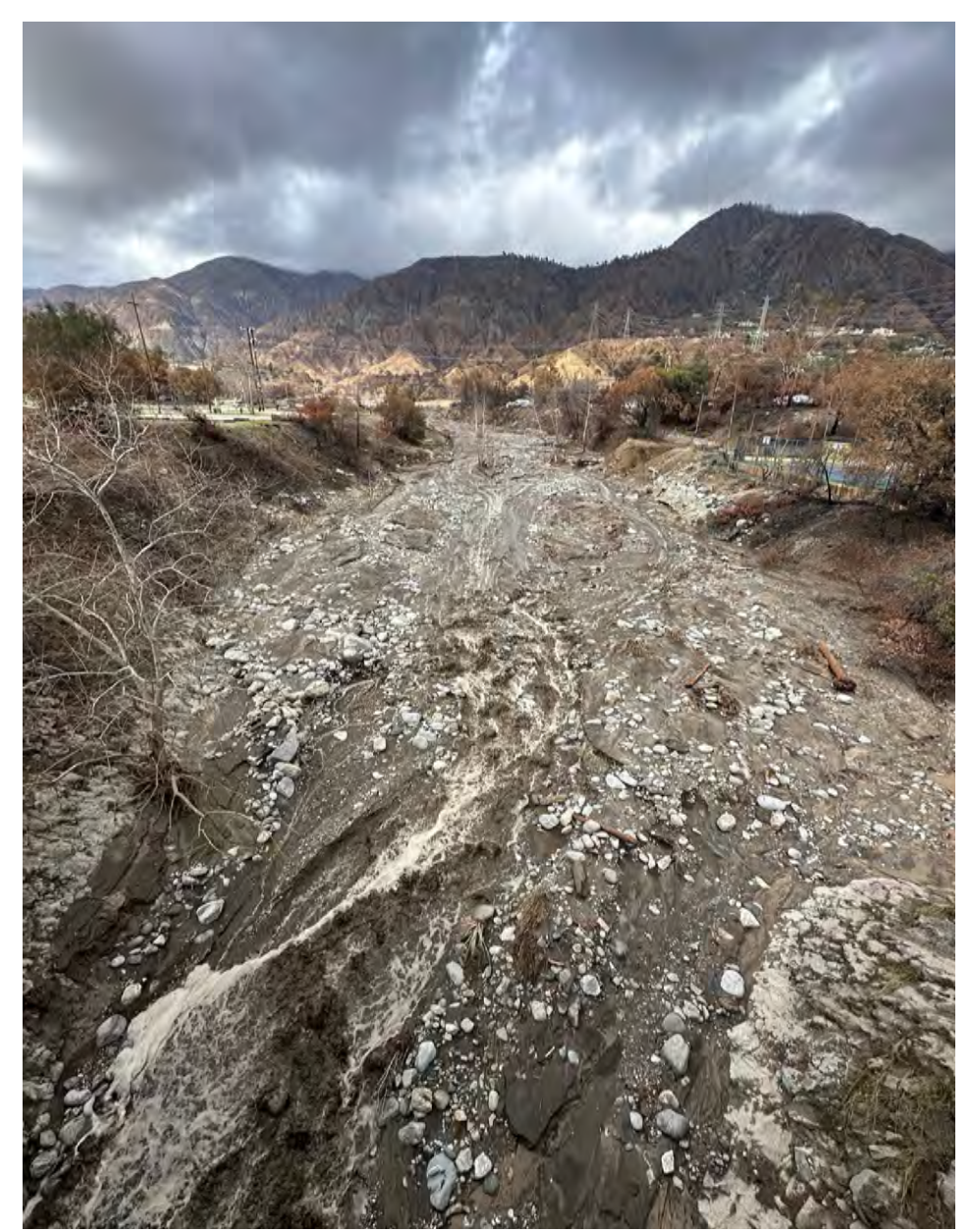
View of Eaton stream after the February rainstorm. See Edgar McGregor's video of the flood: https://www.youtube.com/watch?v=Oyh3tCP8xd8