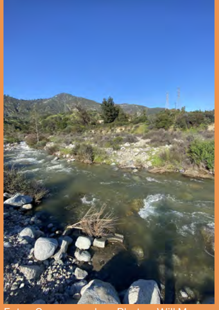
aton Canyon wash

For those who are interested in contributing to this project and who have images that they'd be comfortable with sharing publicly, you can email Elaine at <code>ehhbrown@gmail.com</code>. Along with your photos, please provide a brief description of where the pictures were taken in the natural area, what is pictured, and when the picture was taken, if possible. If some of this information is unknown, it would still be a great addition to the project. Please also indicate if you'd like your name to