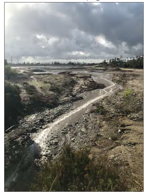
Eaton Canyon Reservoir on February 14, 2025